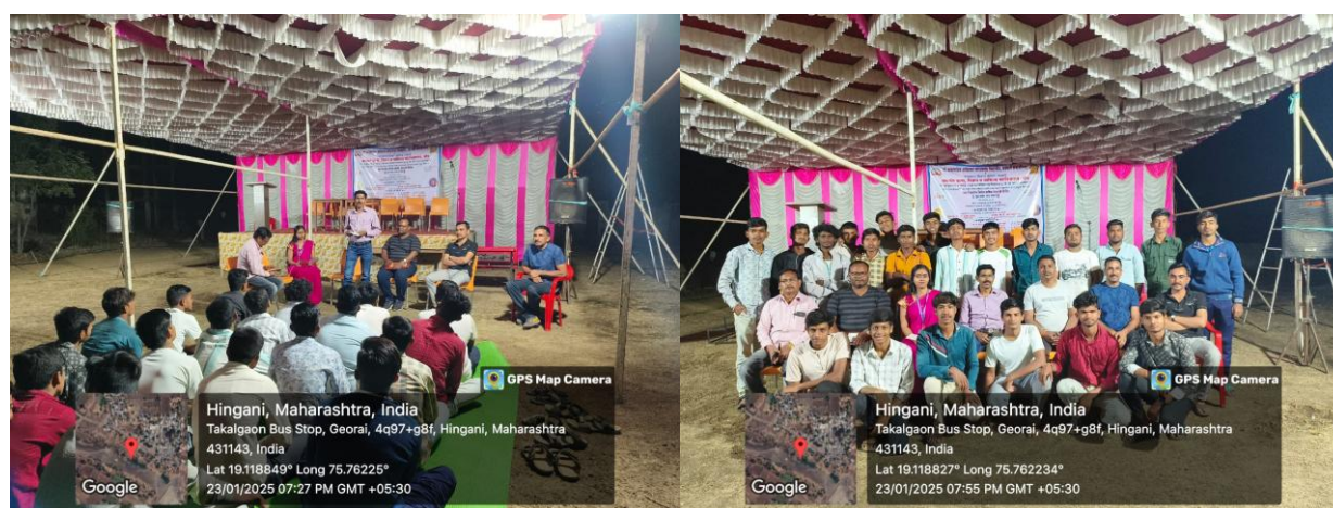
Visit of University NSS director and Beed district NSS Coordinator